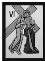
A woman, Veronica, wipes Jesus' face.